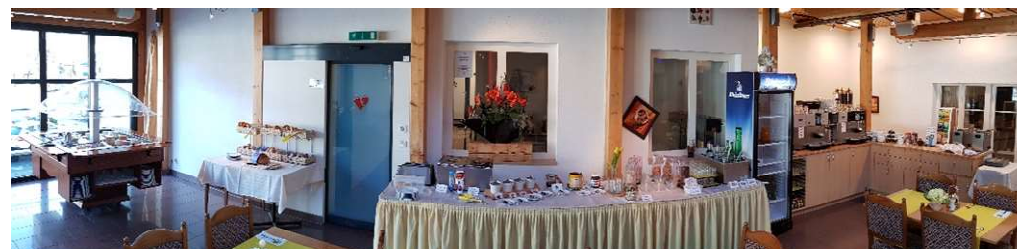
Wintergarten / breakfast buffet